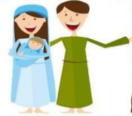
A New Nativity Play for Kids